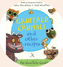
Make a Gruffalo crumble. See the ingredients and how to sheet on page 3.