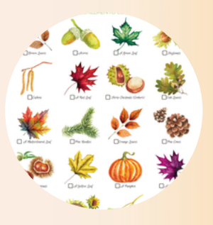
Do an autumn tresure hunt like the one on page 4.