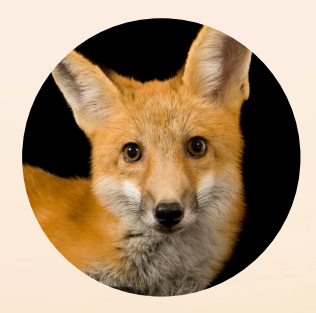
Compare the characters from The Gruffalo and find out some facts about each animal including what they eat and where they find their food. Talk about how they use their different senses to find their food.