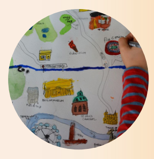
Go on a walk and draw a simple map to show the places you passed. A circular walk is always a good one to try.