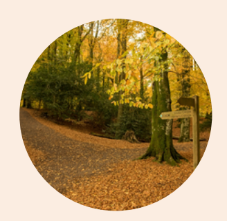
Get outside and have an autumn walk. The children will love to show you Thorncombe Woods after our trip.