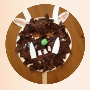
Make a paper plate mask of one of the characters from The Gruffalo.

Please email any photos to foundation@damers.dorset.sch.uk before the end of term so we can share them in class.