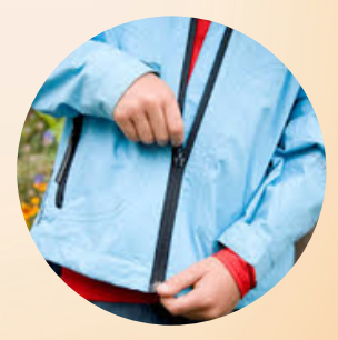
Now is a good time to practise putting on your coat and doing it up before it gets really cold!