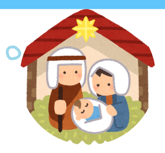
Learn about the Nativity Story in Christianity