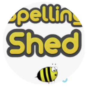
Use Spelling Shed to help practise your weekly spellings